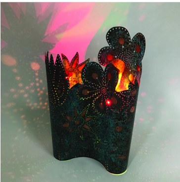
Joe Hemes - Illuminated Sculptures