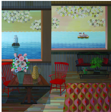
Gail Spaien - Paintings