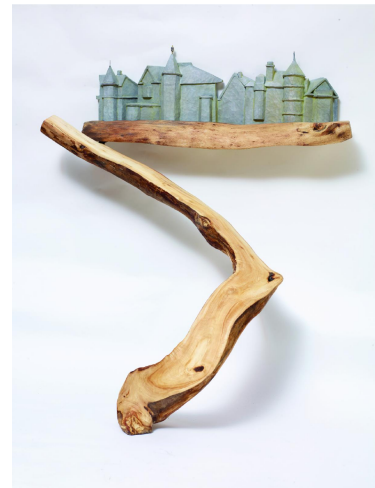
Lin Lisberger - Wood Sculptures