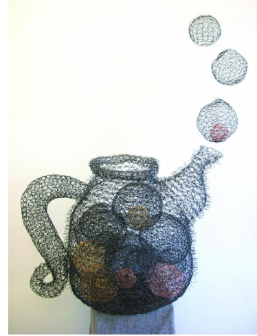
Adrienne Sloane - Fiber