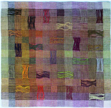
Sondra Bogdonoff - Weavings